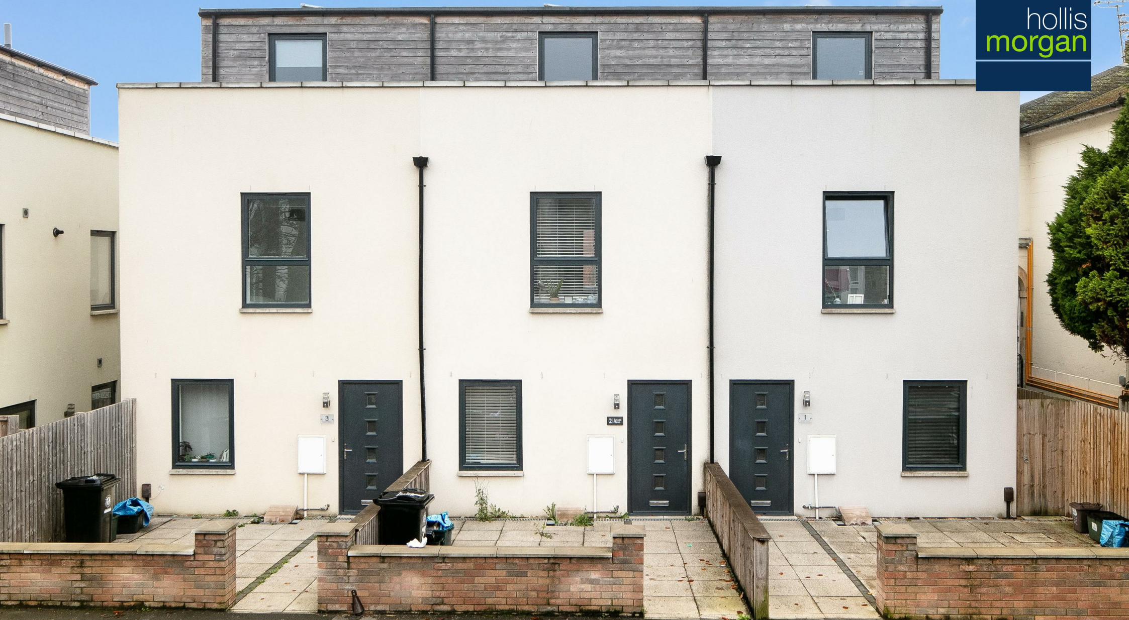
2, Sussex Mews Sussex Place, St Werburghs, Bristol, BS2 9QP